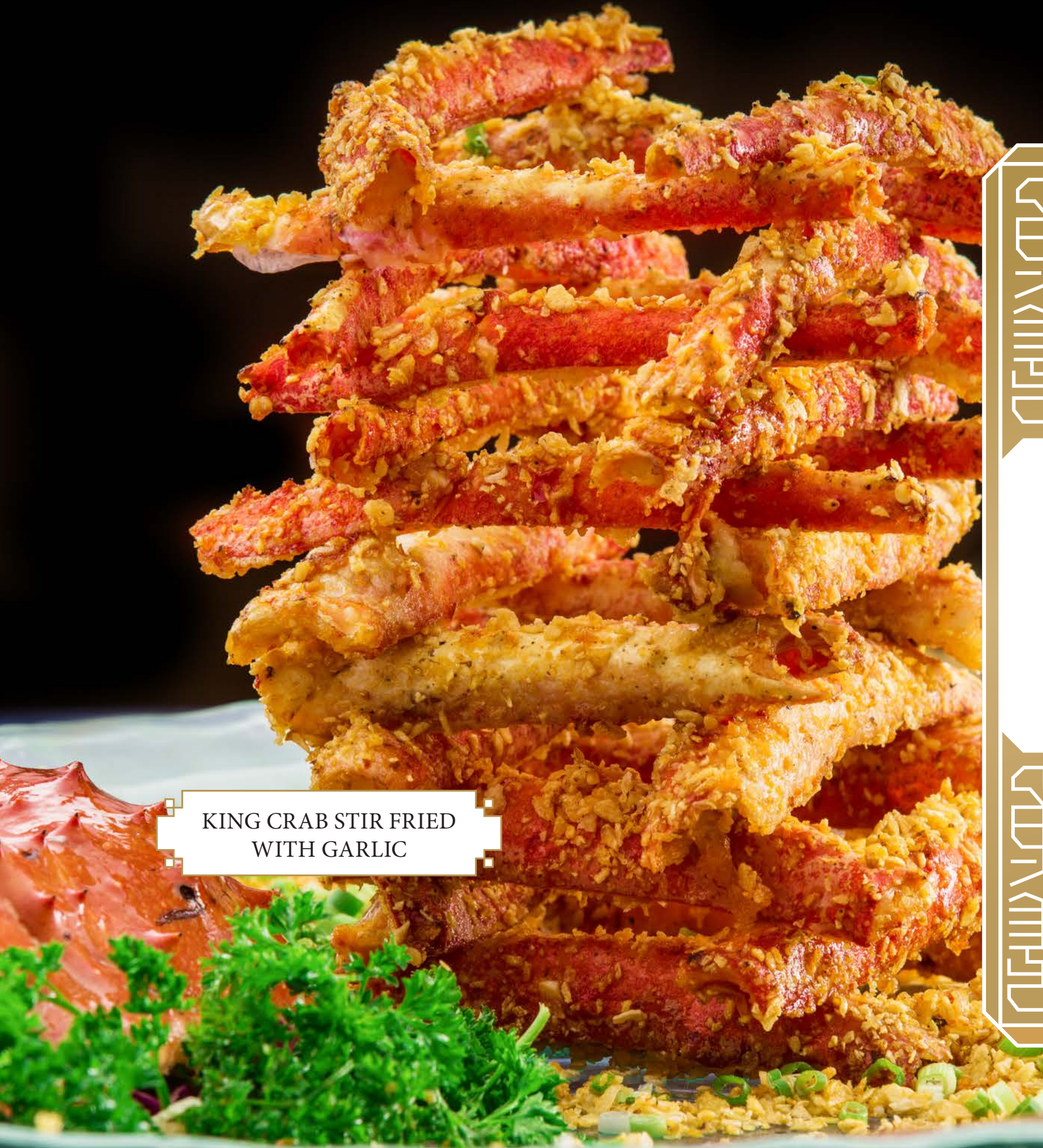
KING CRAB STIR FRIED WITH GARLIC