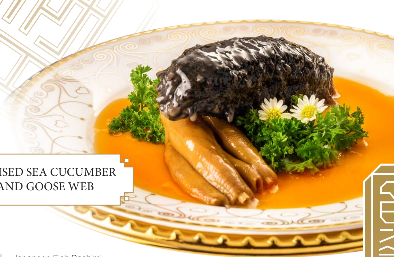
BRAISED SEA CUCUMBER AND GOOSE WEB