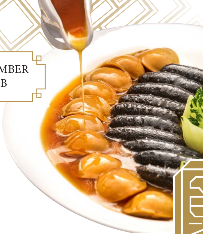
BRAISED SEA CUCUMBER AND GOOSE WEB