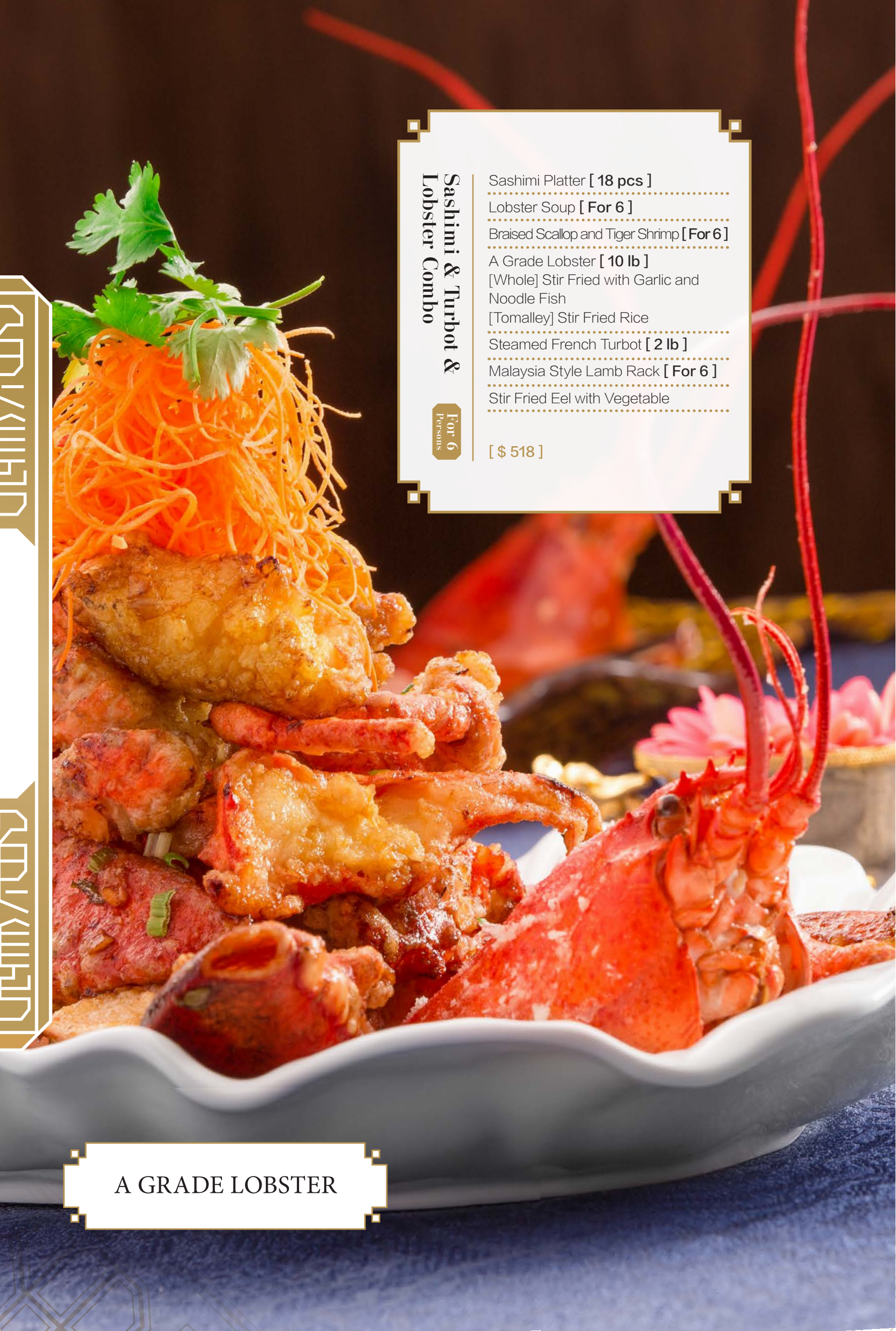
A GRADE LOBSTER