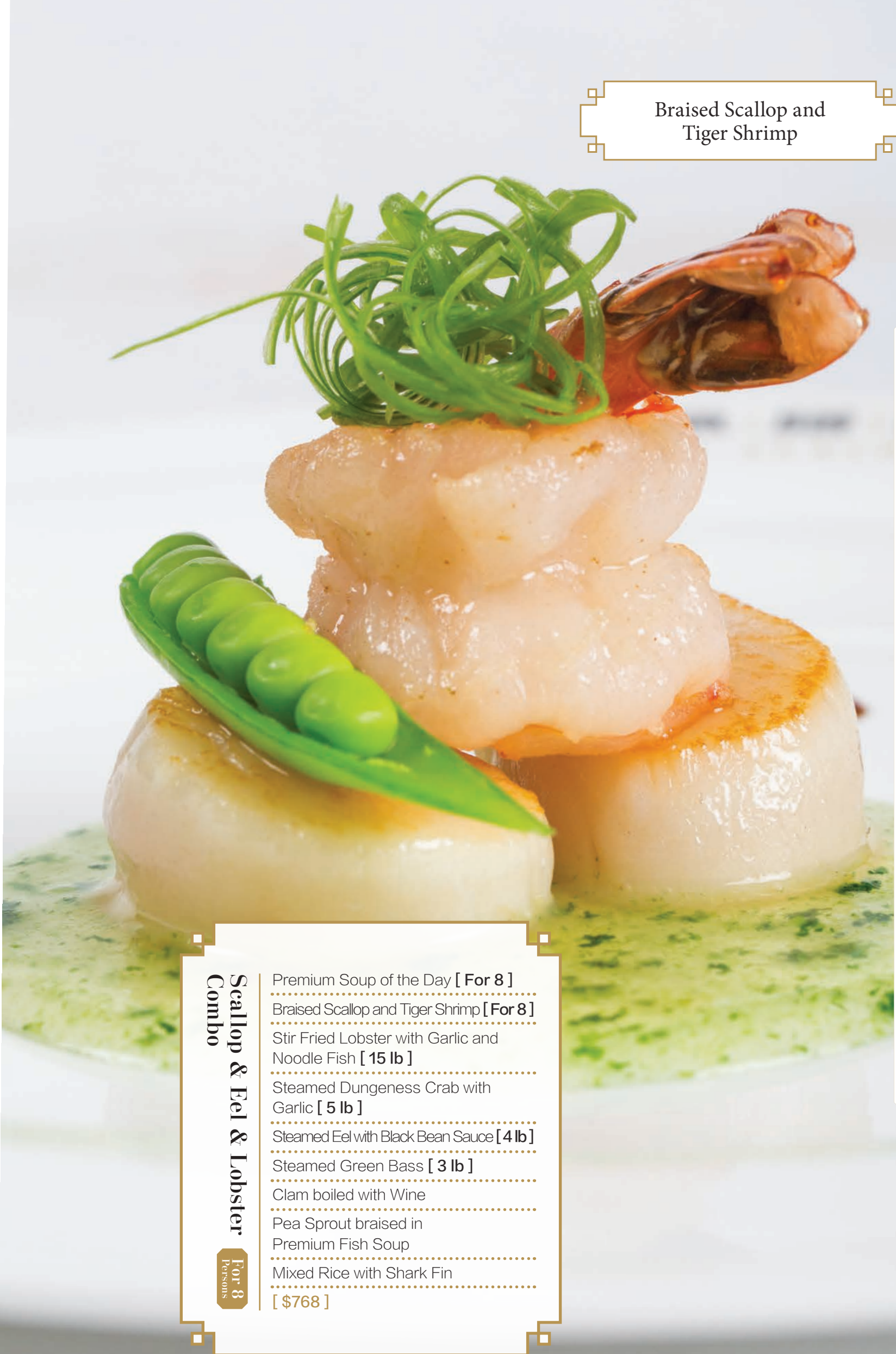
Braised Scallop and Tiger Shrimp