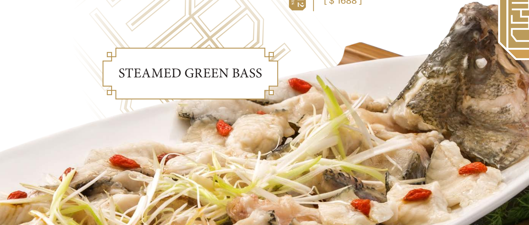
STEAMED GREEN BASS